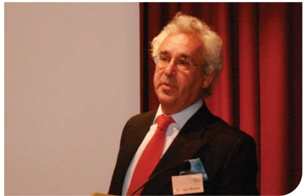
Keynote speaker - Sir Alan Moses, Lord Justice of Appeal