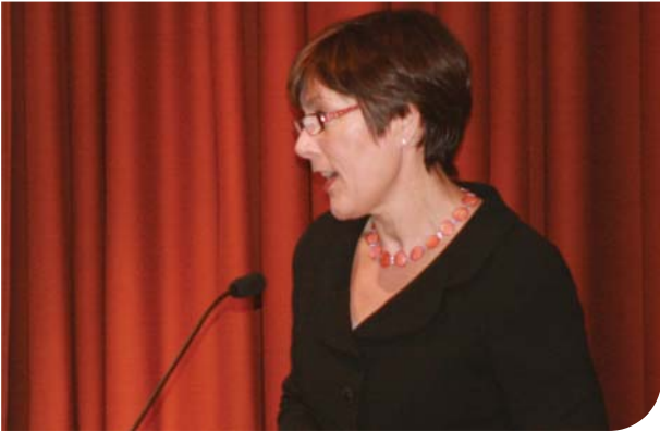
Keynote speaker - Dawn Primarolo MP, Minister of State for Public Health

Delivering the Human Fertilisation and Embryology Bill in Practice