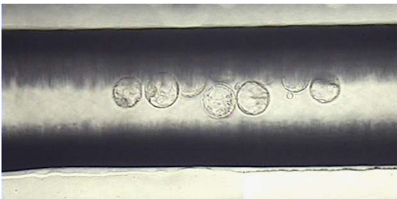
Picture from one of the triplicate AneVivo device batch 3 at day 5